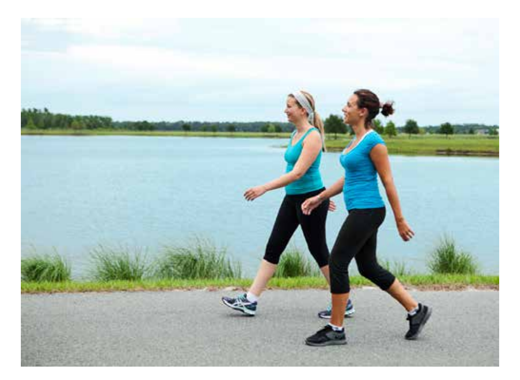
Extensive walking paths on Lake Nona grounds.

Many cities have attempted to establish "clusters" such as Medical City to spur their